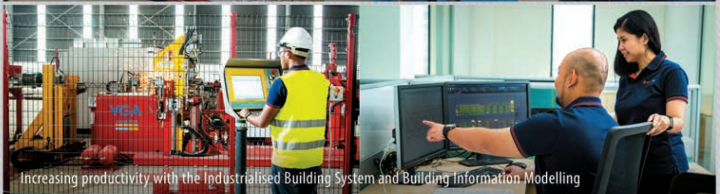
Increasing productivity with the Industrialised Building System and Building Information Modelling