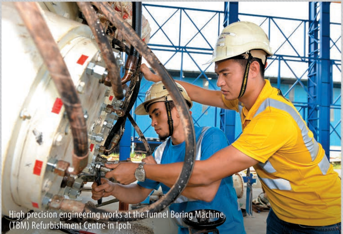
High precision engineering works at the Tunnel Boring Machine (TBM) Refurbishment Centre in Ipoh